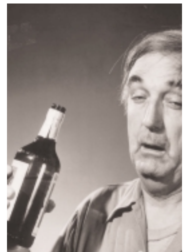
Photographic proof that hashers are not capable of the higher motor skills needed to throw beers at each other.

I have nothing else to add. So, as a bit of inspiration to our HOPS members, I will just include this article that was forwarded to me. And for anyone unhappy in their work, just remember - it could always get worse.