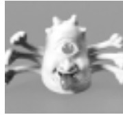
On-Sex: Punk Ass Bitch