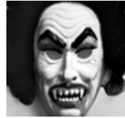
HareRaisers: Tiger's woody