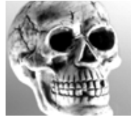
Choir/beer Miester: Fluffy