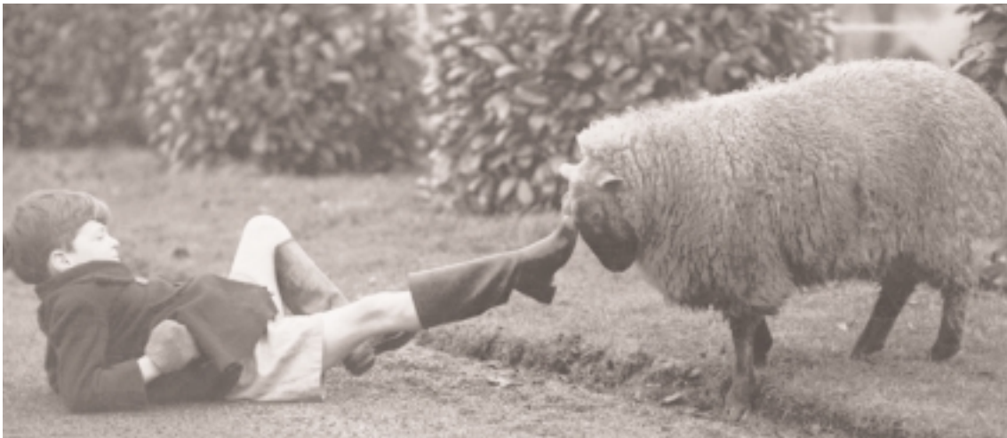
Young Goncang learning as a youth that you should always warm your hands first.

"It's because the animals have gotten too used to Binatang coming over every morning to pull them off," said "Many of them now can't be bothered to engage in real sex."